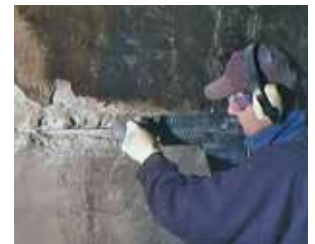
Rehabilitation Patch'n Plug & Megamix