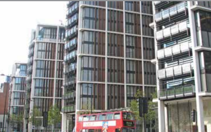
One Hyde Park, United Kingdom