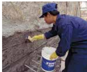
Coating Concentrate & Modified