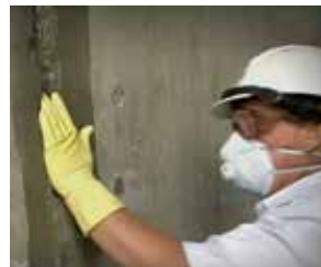
Plugging Patch'n Plug