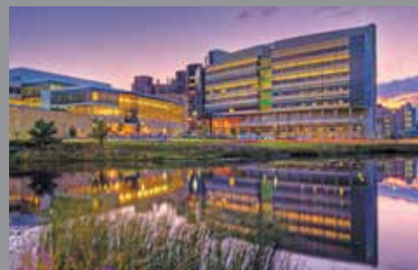
Wisconsin Institute for Medical Research, USA