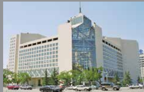
Bank of China, China