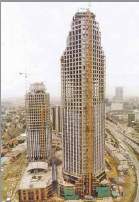
TIS Bank, Turkey