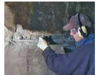
Rehabilitation Patch'n Plug & Megamix