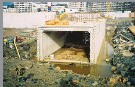
V&A Tunnel, South Africa