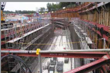
Synchrotron Tunnel, Japan