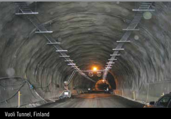
Vuoli Tunnel, Finland