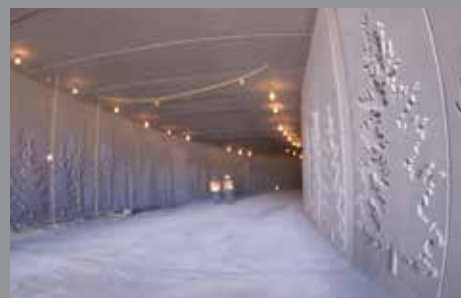
Bremerton Tunnel, USA