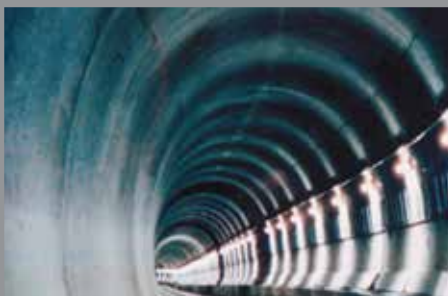
Ankara Subway, Turkey